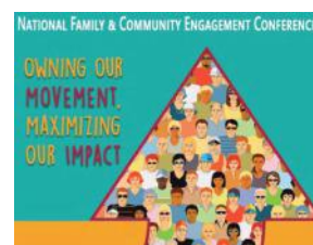
Staff Professional Development