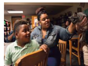
Family Fun Nights