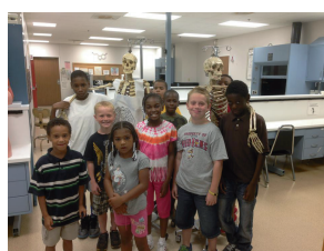
Field trip to Mercy College