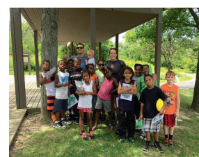
Field trip to the park