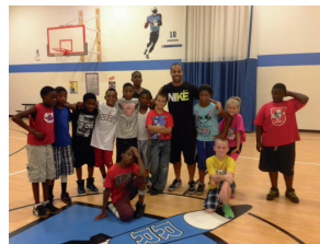
Activities in the gym