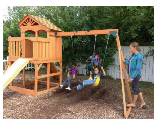
Field trip to the church and gardens