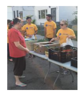
Work with student groups